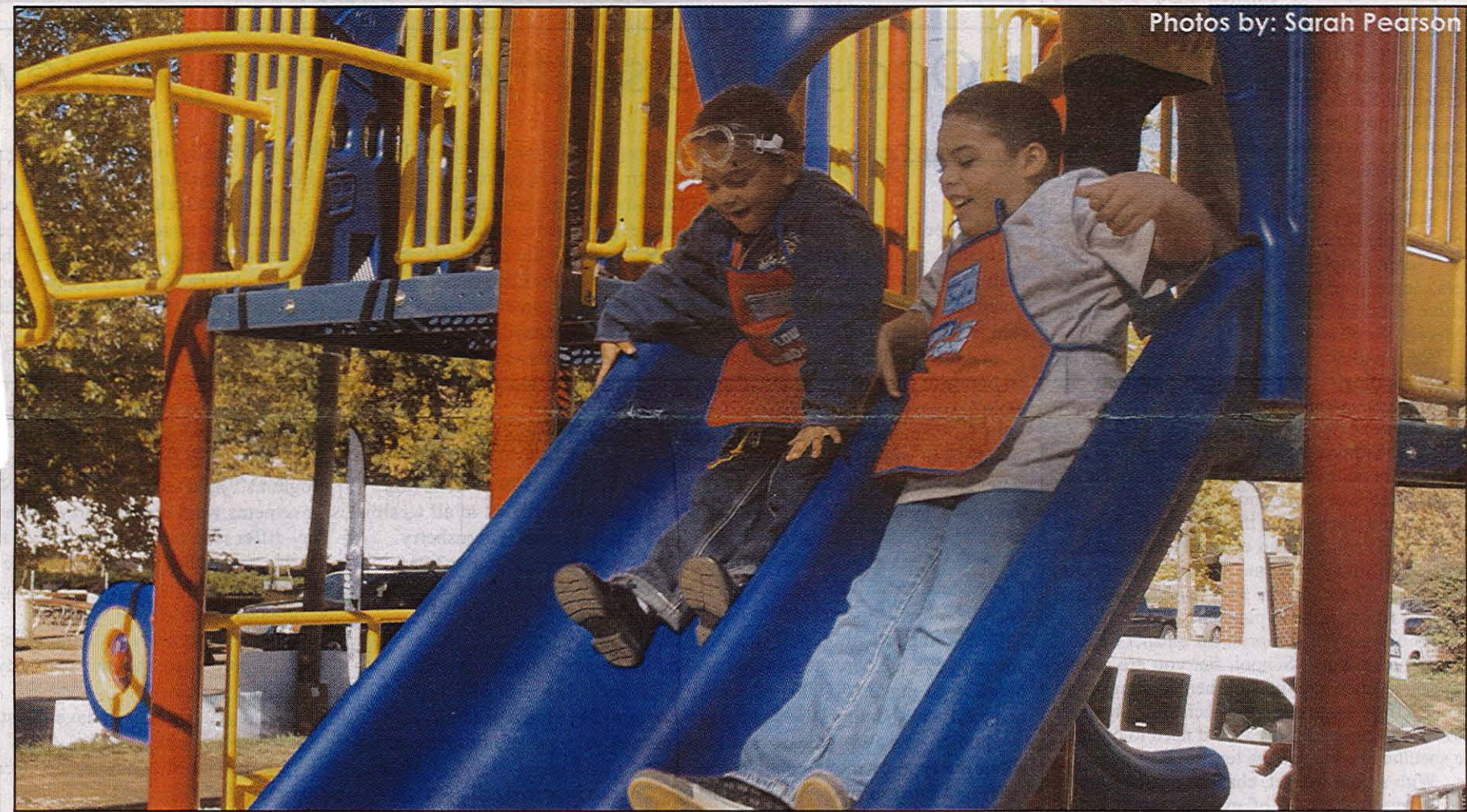
Children happily play in the newly installed playground equipment on Nov. 5 once the ribbon was cut. The play ground was donated from Carter's Kids Foundation.